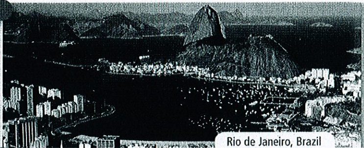
Rio de Janeiro, Brazil

Location means either an exact position using latitude or longitude, or a description of a place in relation to places around it.