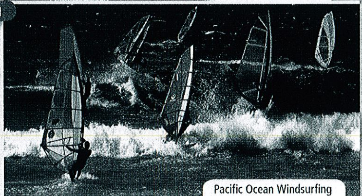
Pacific Ocean Windsurfing

Humans adapt to their environment and change elements of it.